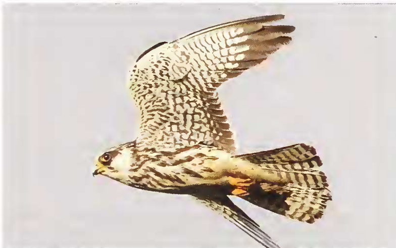
Plate 5. Amur Falcon Falco amurensis , Talogtog, San Juan, La Union, 1 November 2014.